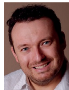
Frank Wind Media Consulting